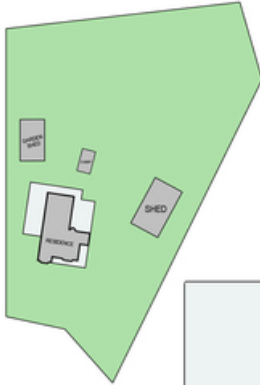
SHED (NOT TO SCALE)